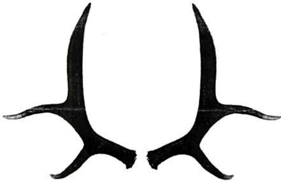
The image above depicts the antlers of a 3x3 bull elk.

The AOO are encouraging harvesters to avoid harvesting mature bull elk. As noted above, the ratio of mature bull elk to cow elk is a cause for concern. In order to protect the population and move towards maximum productivity, the mature bull elk require some assistance. It is recommended that Algonquin harvesters avoid harvesting bull elk with an antler class greater than 3x3 . A 3x3 bull elk is described as having 3 points (tines) on both antlers (see image below). A bull elk with at least one side with 4 or more points should be avoided.